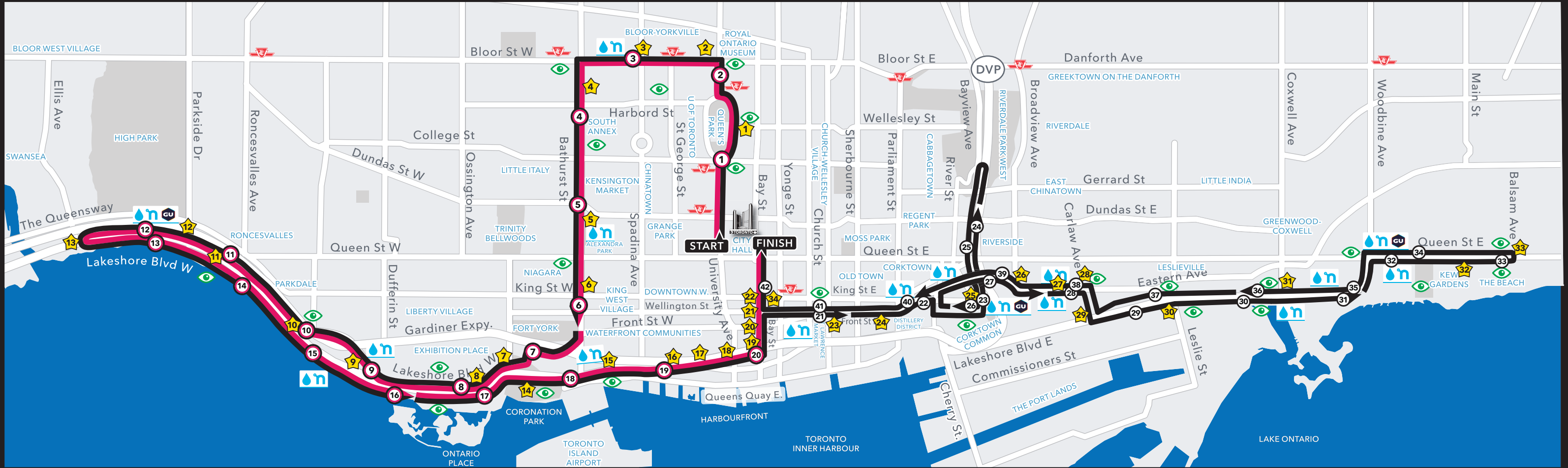
Marathon Route Elevation - Estimated Cumulative rise: 138 metres